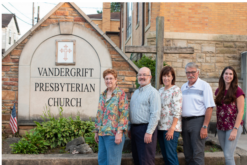
Pastor Search Committee