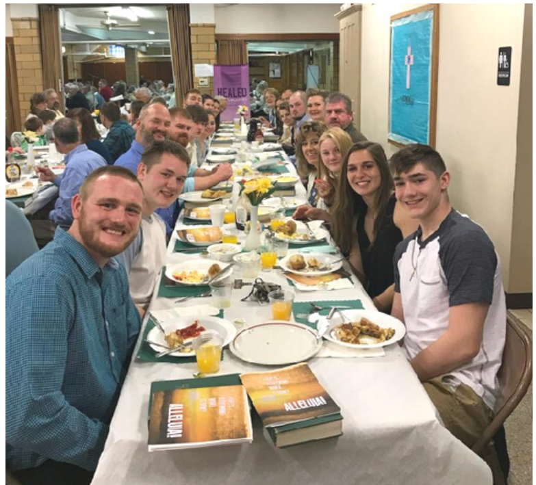
Easter morning Love Feast