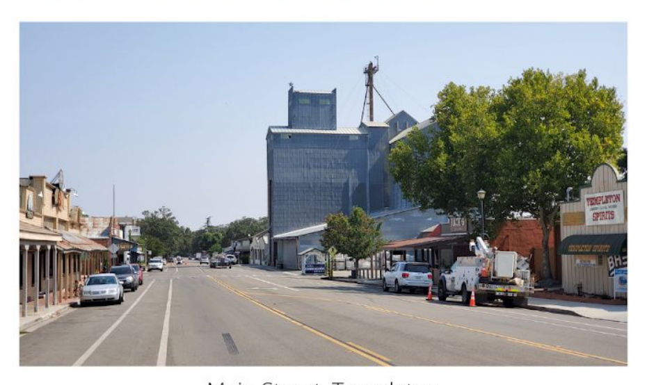
Main Street, Templeton