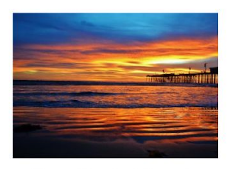
Pismo Beach at Sunset

Templeton, CA has a small-town feel and is located about five miles south of Paso Robles and 20 miles north of San Luis Obispo. Our church campus is in the heart of Templeton, located just two blocks from the local elementary, middle and high schools and within walking distance of several restaurants and coffee shops.