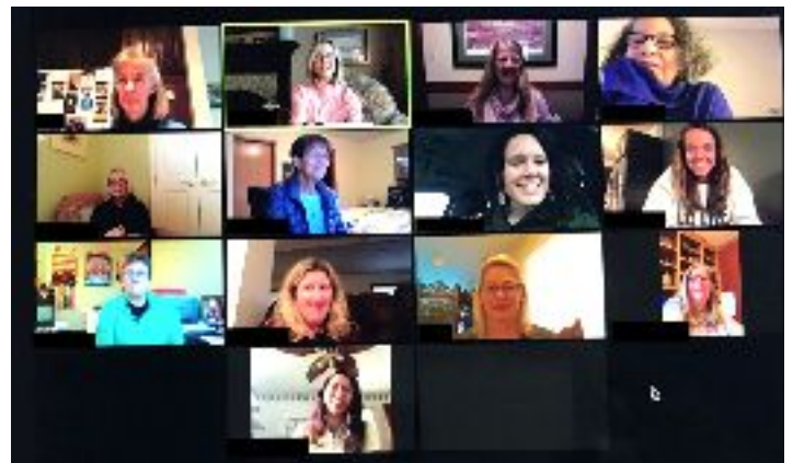
(Bible Study, Coffee Fellowship, Senior Luncheon, ZOOM Bible Study)